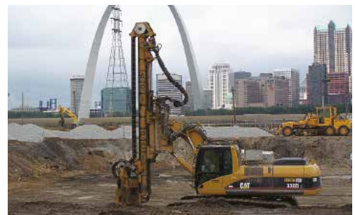
Casino Queen Hotel & Casino East St. Louis, Illinois