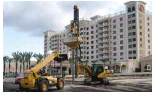
Echelon Pointe at Carillon St. Petersburg, Florida

Geopier Foundation Company developed the Rammed Aggregate Pier® (RAP) system to provide an efficient and cost effective Intermediate Foundation® solution for the support of settlement sensitive structures. Through continual research and development, we've expanded our system capabilities to offer you more. Our design-build engineering support and site specific modulus testing combined with the experience of providing settlement control for thousands of projects provides an unmatched level of support and reliability to meet virtually all of your ground improvement challenges.