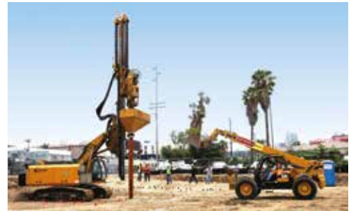
A-1 Storage San Diego, California