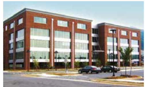
Carilion Riverside Medical Building Roanoke, Virginia